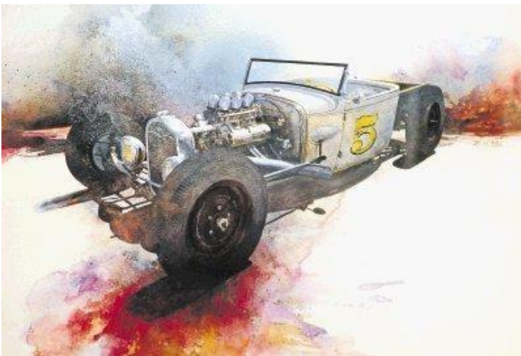
Bruce White's "30 Ford Pickup" in acrylic won Best of Show in the 27th All Colorado Juried Art Exhibit at the Depot Arts Center in Littleton.