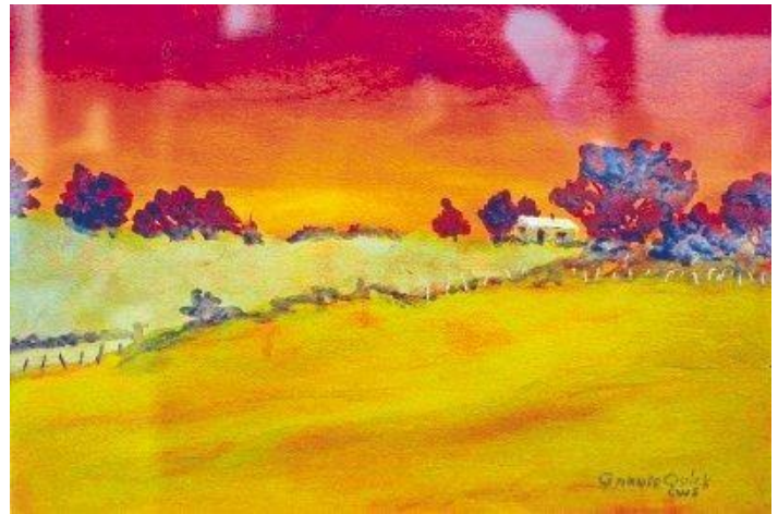
Garnie Quick's "Evening Glow," third-place winner, is executed in acrylic used as a water medium (transparent), and portrays a brilliant sunset sky over a rural landscape.